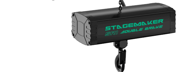
Chainrunner fully retracted