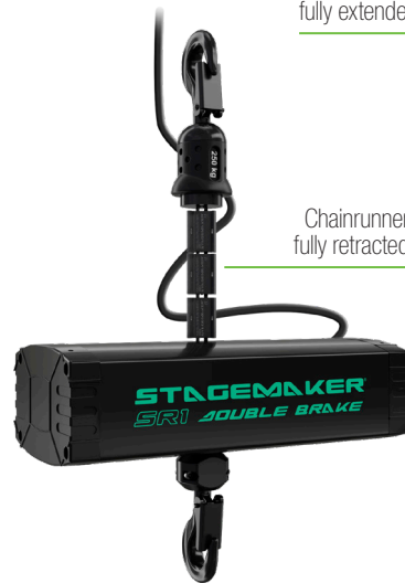
Chainrunner fully extended