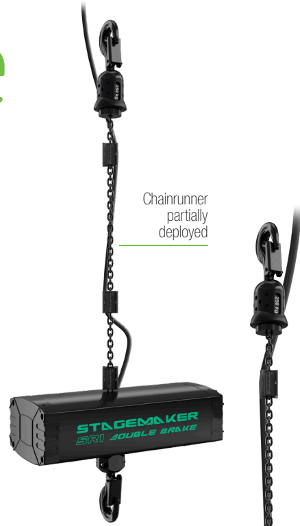
Chainrunner partially deployed