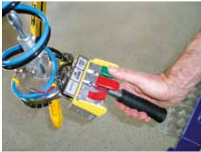
Manual button (valve) control unit

The EQUIBLOC AIR® range includes five models of load balancers for loads from 70 kg à 350 kg*.